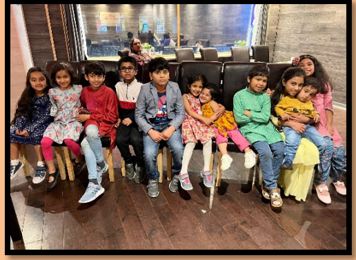
The Next Generation !!!