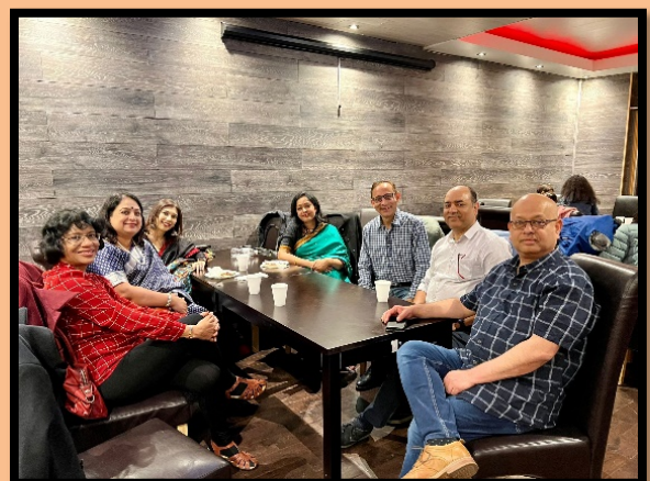
Welcoming our new Members to The Family