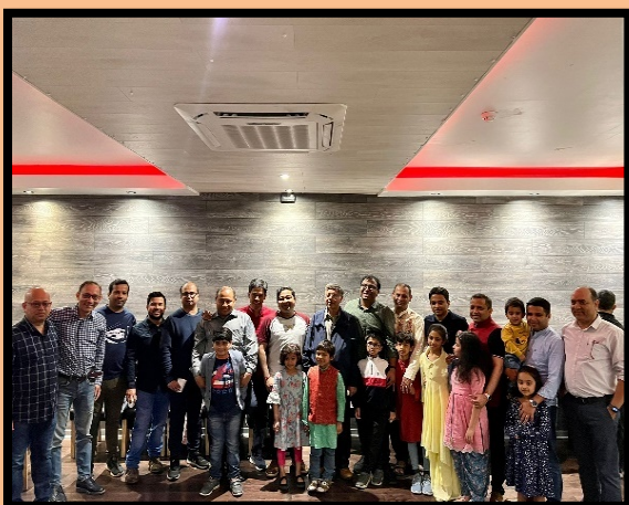
Posing in between ADDA

Here, in our home away from home, we celebrate our Bengali Noboborsho with our University Alumni who have become our extended family and we enjoy every bit of it. On that day, we also welcomed few new members of this extended family of ours.