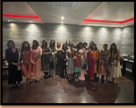
Ladies of UK Chapter dressed up for Poila Boishakh