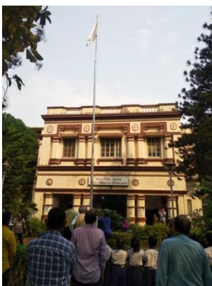
Main Building JU