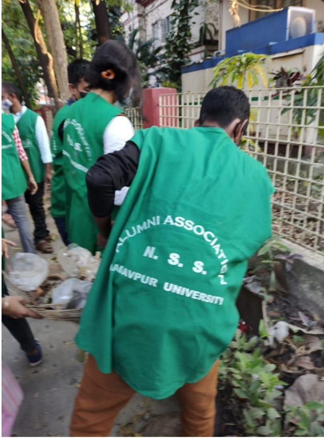
Our regular activities