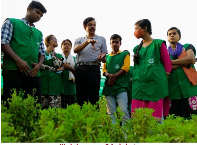
Workshop on medicinal plants

collaboration with NSS for the convocation and other oncoming events.